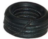
Jensen Packing Sold by the Set