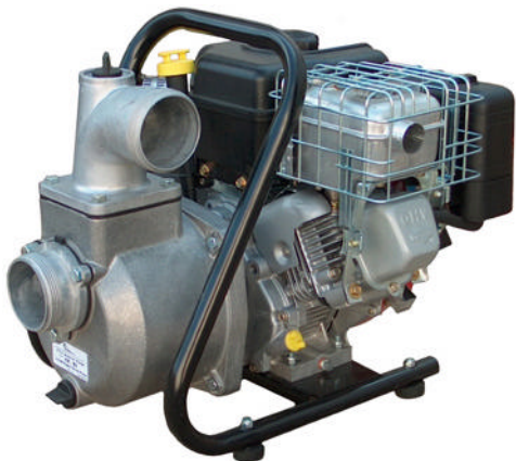
NX83 3" 5HP